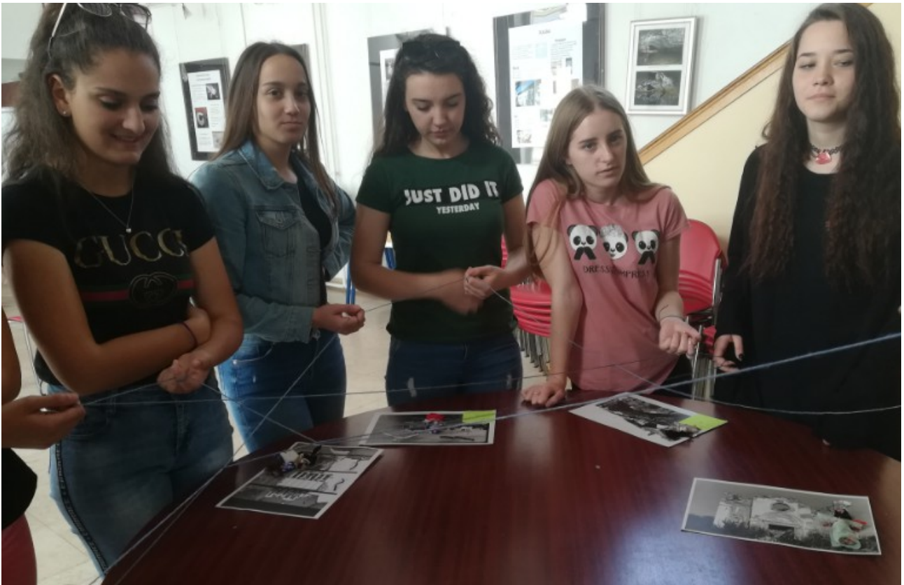
Participants presenting their work