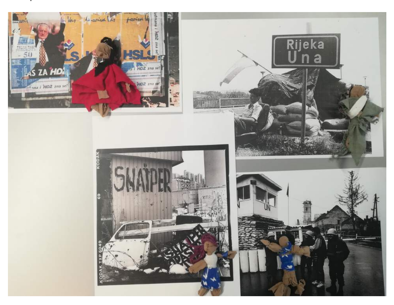
The dolls made by the participants