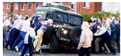
Holy Cross Primary School protests