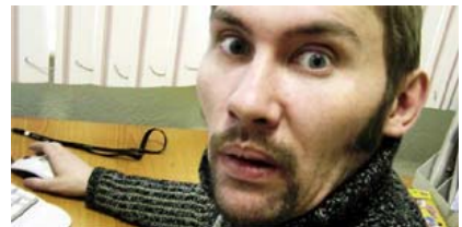
-isms: 'Yous should click here - it's class like'