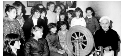
Ulster American Folk Park