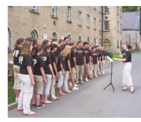
'Voices in Praise' Youth Choir from Maryland, USA at Glencree, July 2006.

The 2007 Summer School takes place over the weekend of 24th - 26th August.