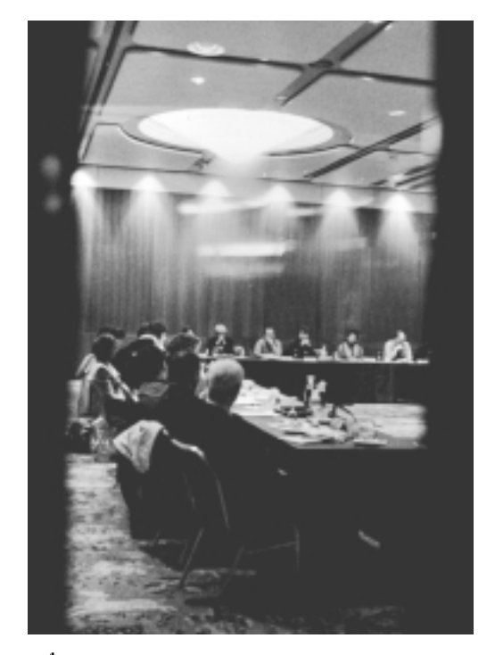
, a n z . , z o, a,

proposals for an appropriate organisation structure. The Interdepartmental Committee also recommended conducting research to obtain information on the specific needs of refugees. In this regard, a research project will be commissioned with a view to the development of a comprehensive strategy for integration. This strategy will identify in further detail the scope to maximise existing resources in both the state and voluntary sectors to facilitate integration.