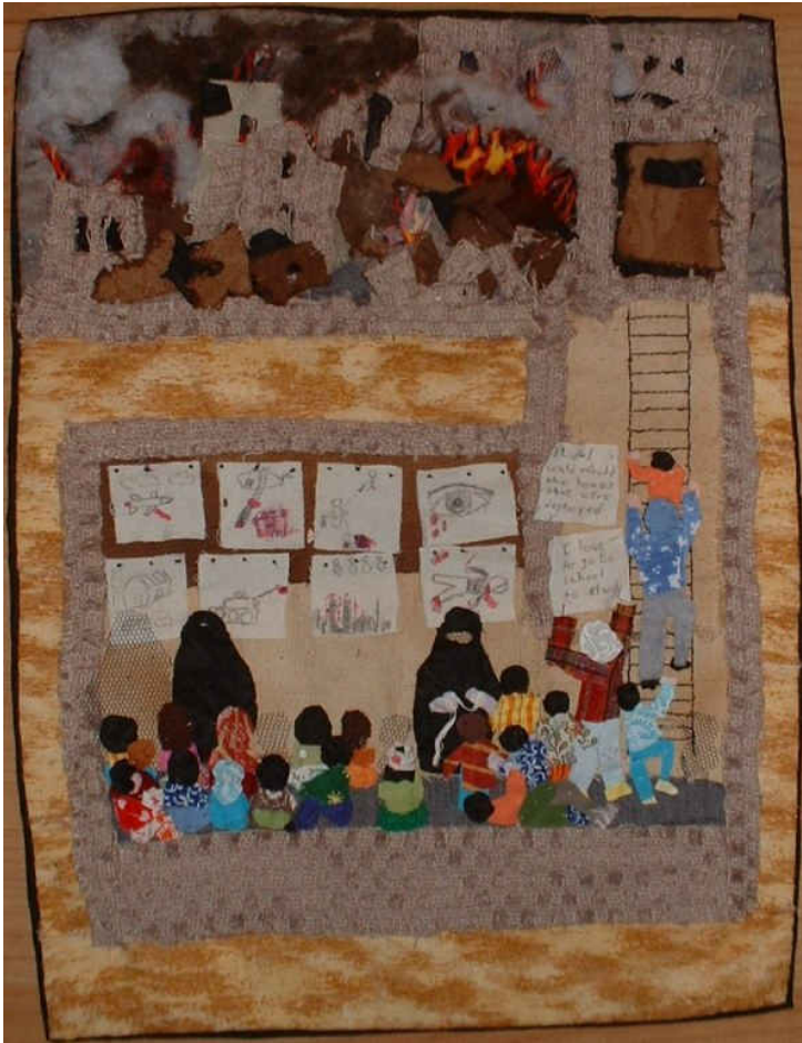
Aleppo school English arpillerera, Linda Adams, 2016 Photo Linda Adams Conflict Textiles collection

In March 2011, inspired by the Arab Spring, Syrians took to the streets, in ever-increasing numbers, demanding reform of the oppressive Assad regime. Repression of these nonviolent protests by Syrian Armed Forces & Allied militia was immediate and brutal. Soon the conflict escalated into civil war between government and rebel forces, with both sides aided by a proliferation of armed groups and powerful external players. As 2016 drew to a close, the country's infrastructure was in ruins; over a quarter of a million Syrians had been killed and an estimated 13.5 million people, including 6 million children, were in need of humanitarian assistance.