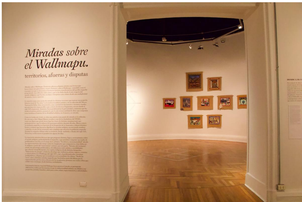
The entry to Díasporas Textiles from the Miradas sobre el Wallmapu exhibition space on the second floor of the Museo Nacional de Bellas Artes.