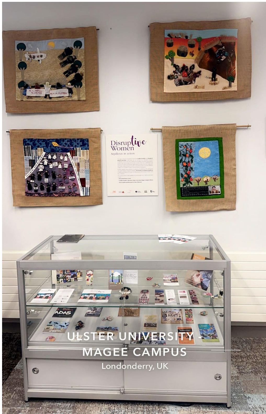
The arpilleras and accompanying material on display.