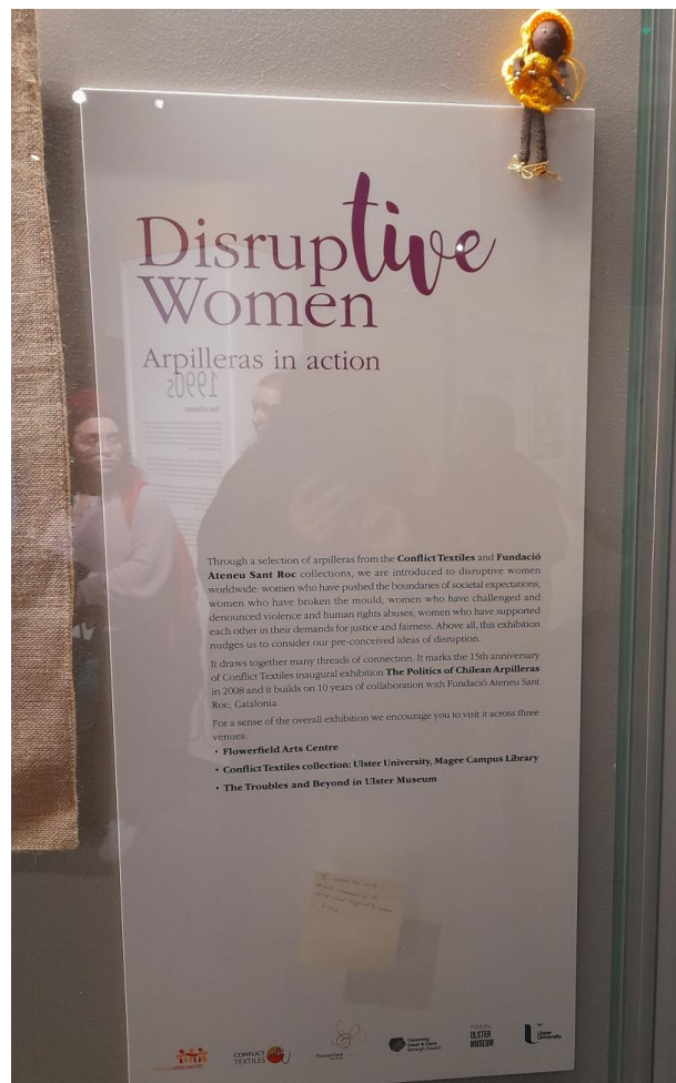
A 'Disruptive doll' occupies her space on the 'Disruptive Women' poster.