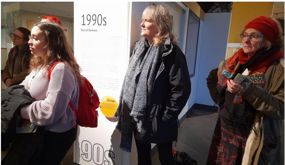
Listening, absorbing and getting a sense of the arpilleras on display.