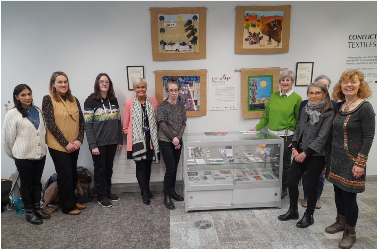
The Conflict Textiles team and colleagues from Ulster University, the Tower Museum, the Void Gallery and Ulster Museum at the opening of the 'Mujeres Disruptivas' exhibition in Magee Campus Library.