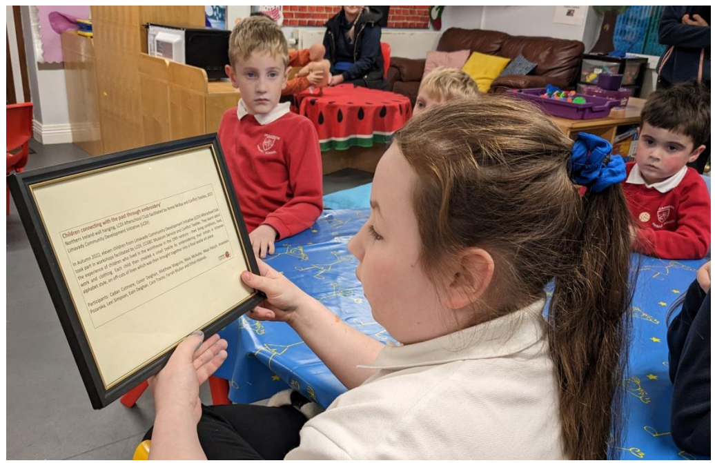
Studying the textile description.