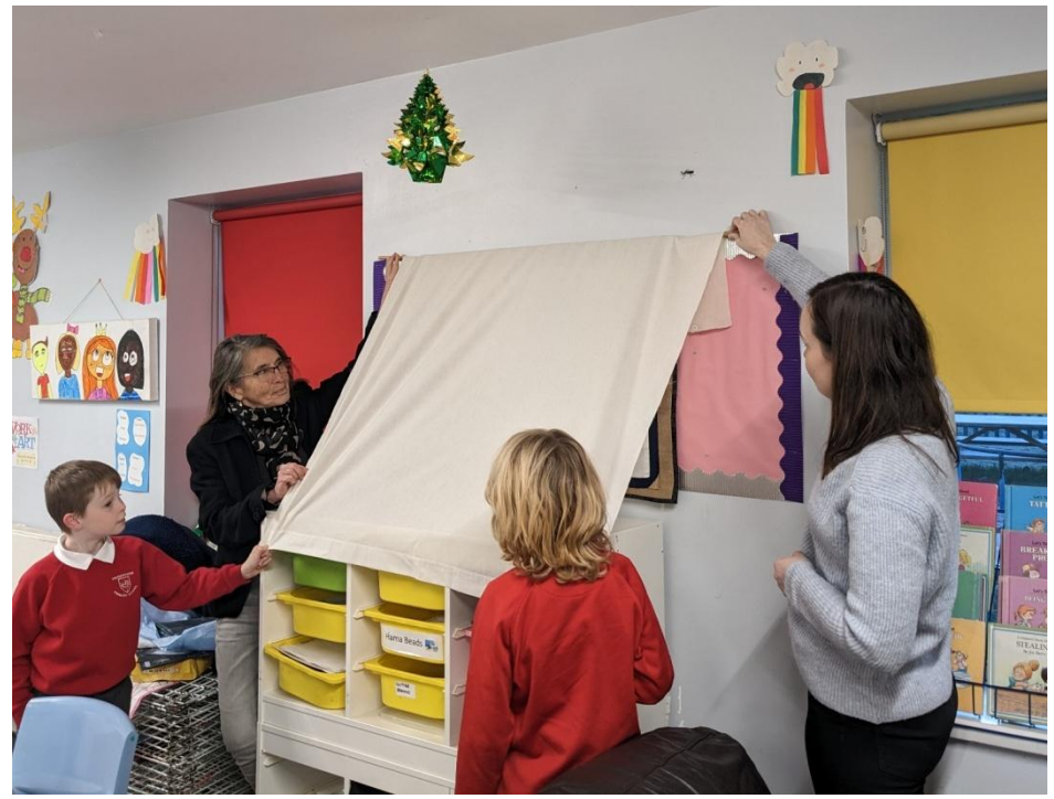
Preparing to unveil! (Photos © BCLLPS).