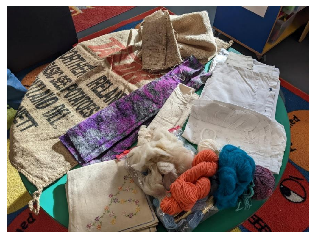
A selections of materials, fabrics and yarns.