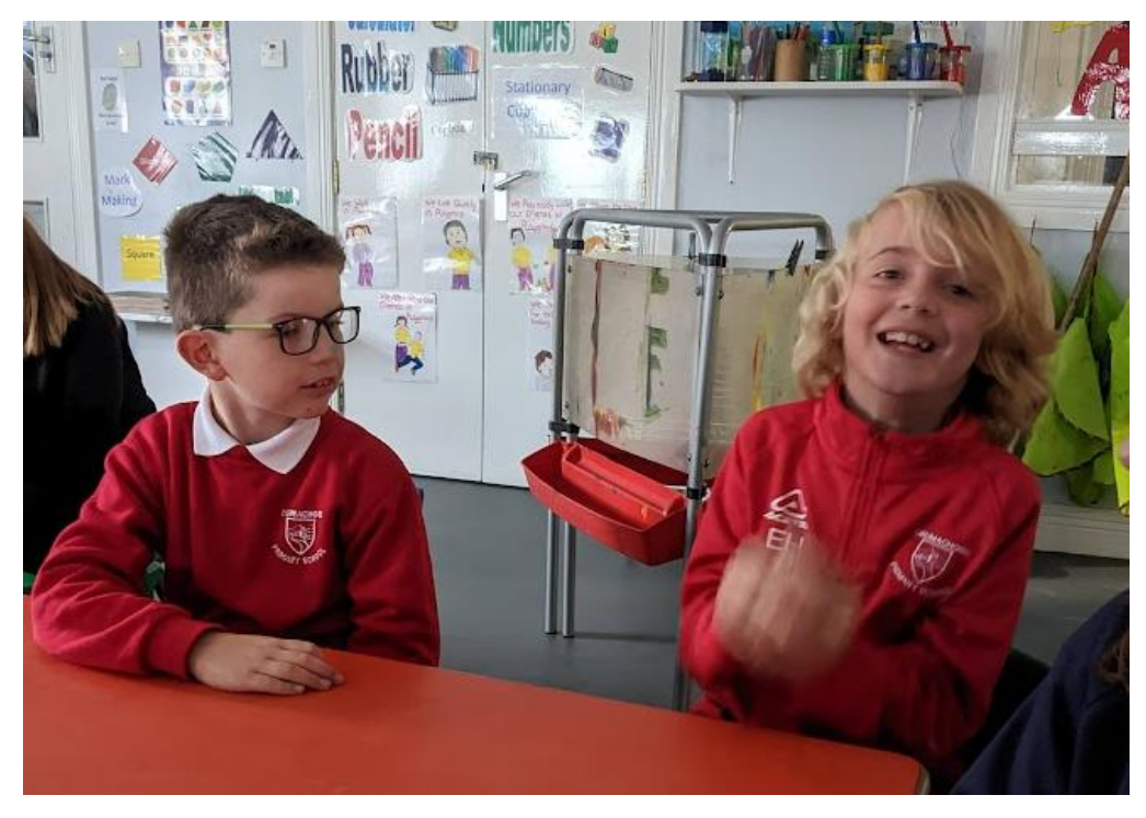
Shaking the milk to make butter.