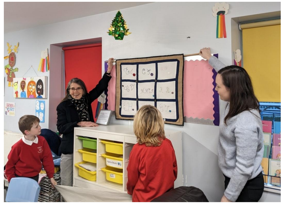
Children see the collective piece for the first time.