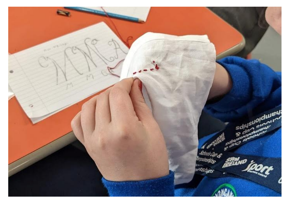
Children embroidering their initials following the Victorian alphabet.