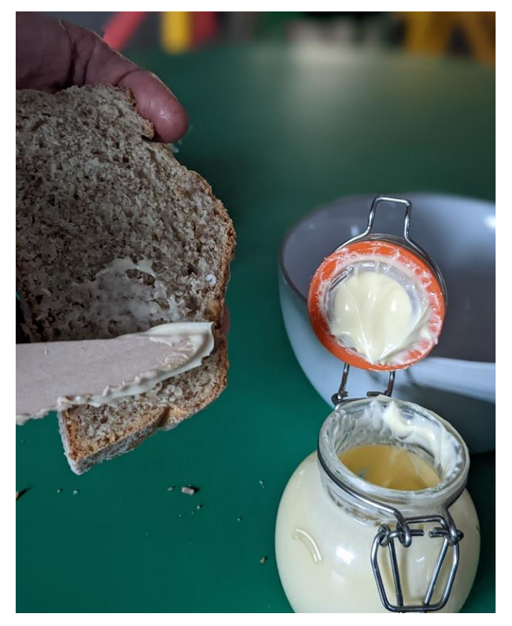
Taste tasting the butter made by the children.