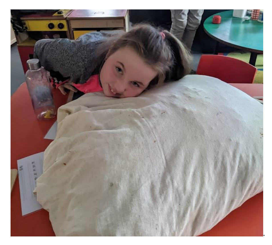
Trying out the straw mattress for size