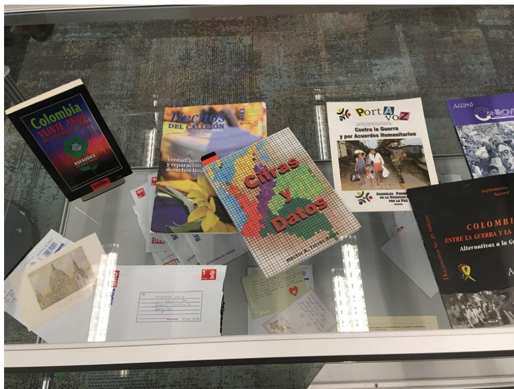
A selection of books on display relating to the conflict in Colombia. Some of the envelopes in which the dolls arrived at Conflict Textiles are also visible. Many were accompanied by handwritten messages.