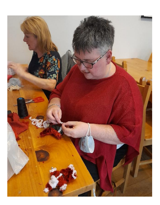
Stitching, cutting, threading, concentrating, reflecting – engaged in the process of creating the textiles.