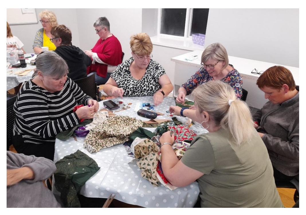
Engrossed in the task of creating textiles representing Christmas. (Photo \ \ \ \ \