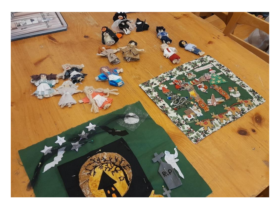
A selection of the textile pieces created; ready for handing onto Deborah Stockdale who will mount them as a collective textile.