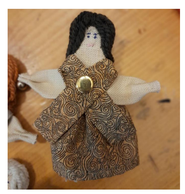
A selection of the dolls created.