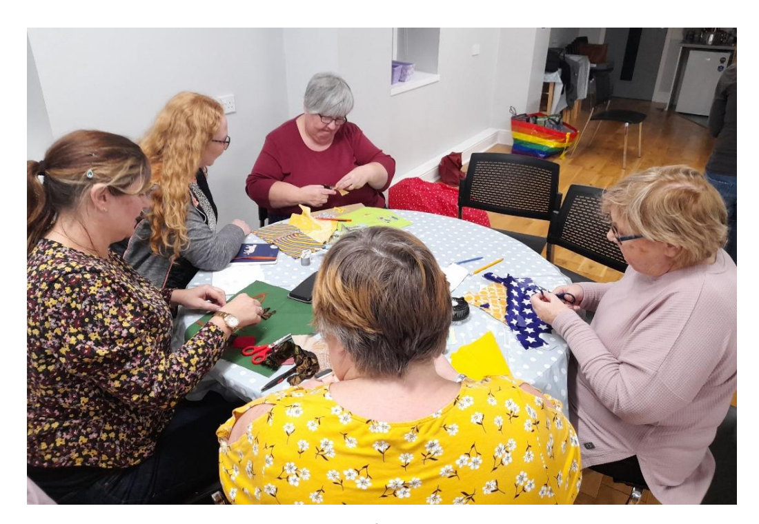
These women are absorbed in the world of textiles as they create Halloween themed panels.