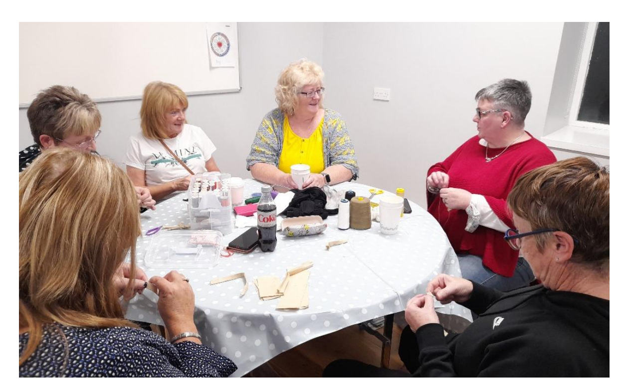
Stitching and chatting - the ladies immersed in sewing their arpillera style dolls.

This series of four workshops, facilitated by Conflict Textiles (CT) curator Roberta Bacic and CT Fabric Artist Deborah Stockdale, was commissioned by the Binevenagh and Coastal Lowlands Landscape Partnership Scheme. Twenty five women from Limavady Community Development Initiative (LCDI) Hen's Shed took part. Through these workshops the group of women reflected how the former workhouse is used today and created small textile pieces representing its present use. To complete the initiative, Deborah Stockdale will bring together these different textile elements into a final textile art piece which will be unveiled in Limavady Community Development Initiative in 2022.