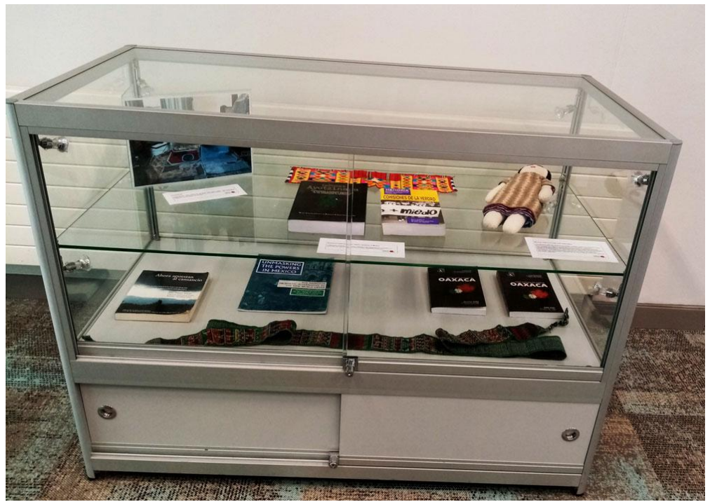
The Mexican doll and huipil yoke embroidery completes the display.