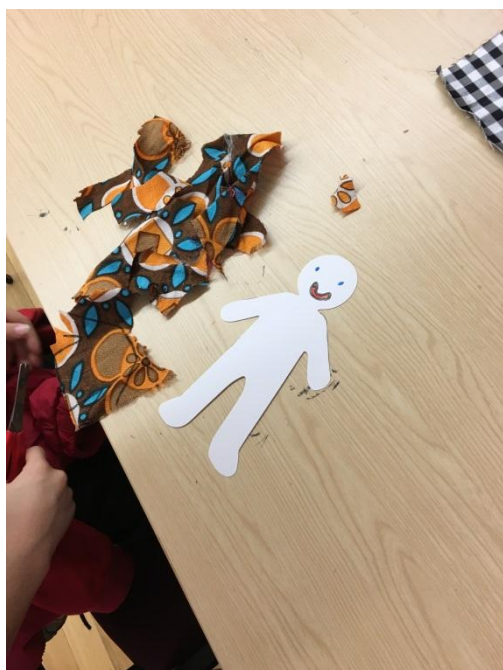
A pupil starts cutting material for the shirt for his doll.