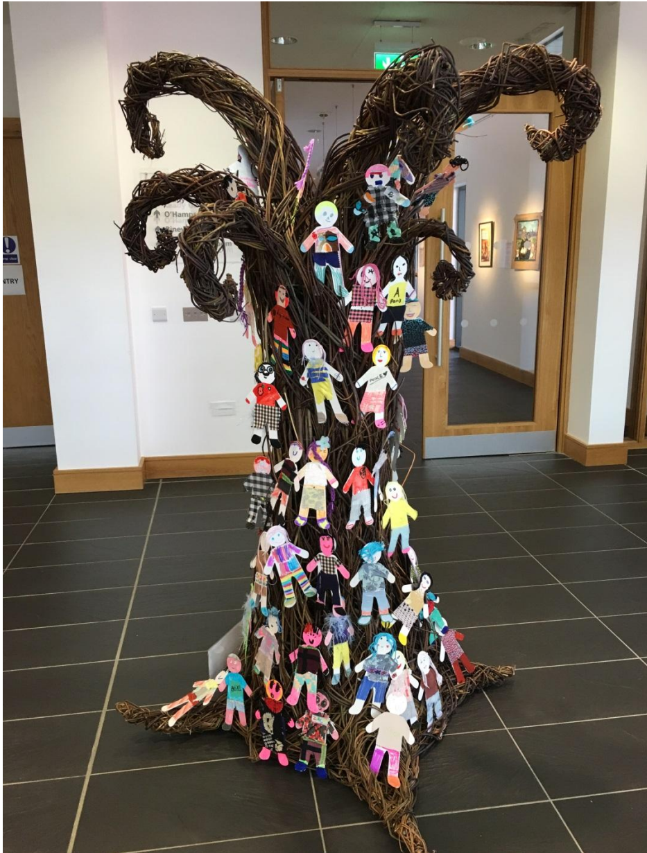
The willow tree display within the exhibition at the Roe Valley Arts & Cultural Centre.

Each workshop was greatly enjoyed and very well attended by schools which represented the Causeway Coast and Glens Borough Council area.