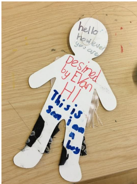
A doll called Sam.

Some pupils also wrote messages on the back and each wrote who the doll was made by.