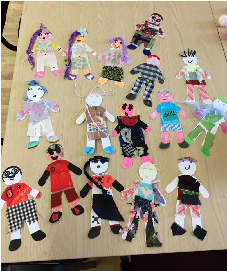
A selection of dolls created by pupils during remembrance week which include some that pupils decided to add poppy's to.

Pupils also had the opportunity to complete an invitation to take home and invite their parents, siblings, grandparents or friends to come and see their doll within the exhibition. One school even wrote an invitation to invite their Principal to see the work the class had done.