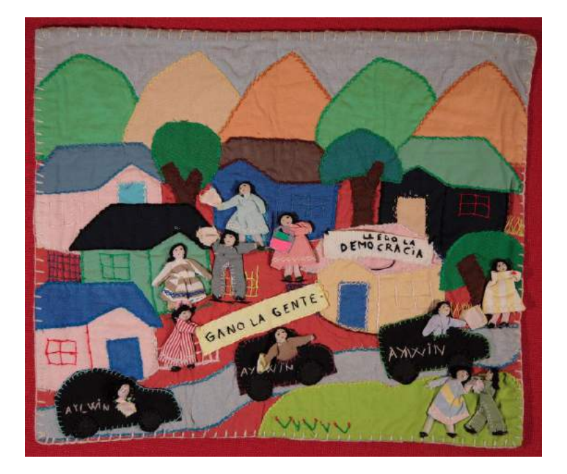
'Ganó la gente/People have won', Anonymous.