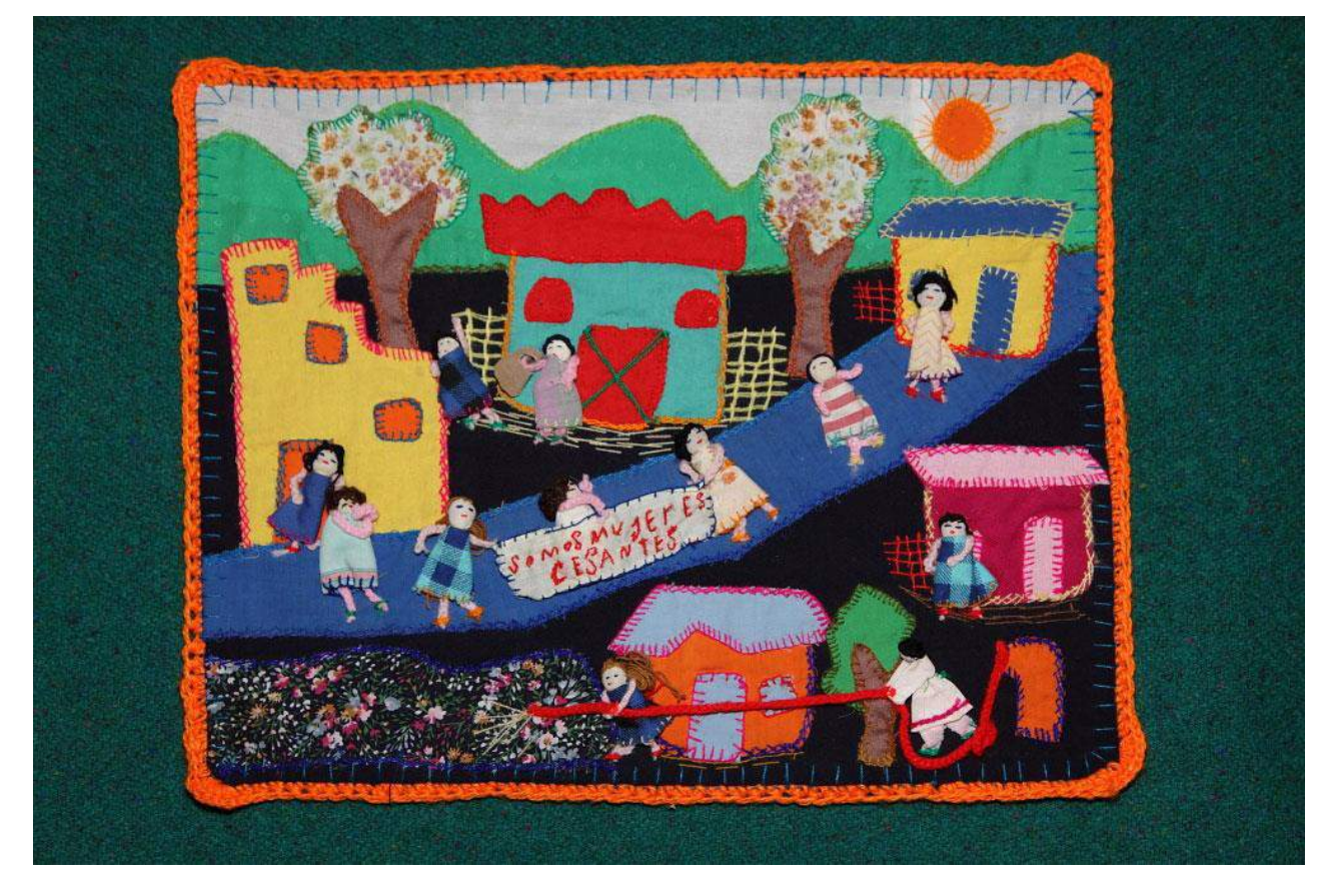
'Somos Mujeres cesantes / We are unemployed women', Anonymous.