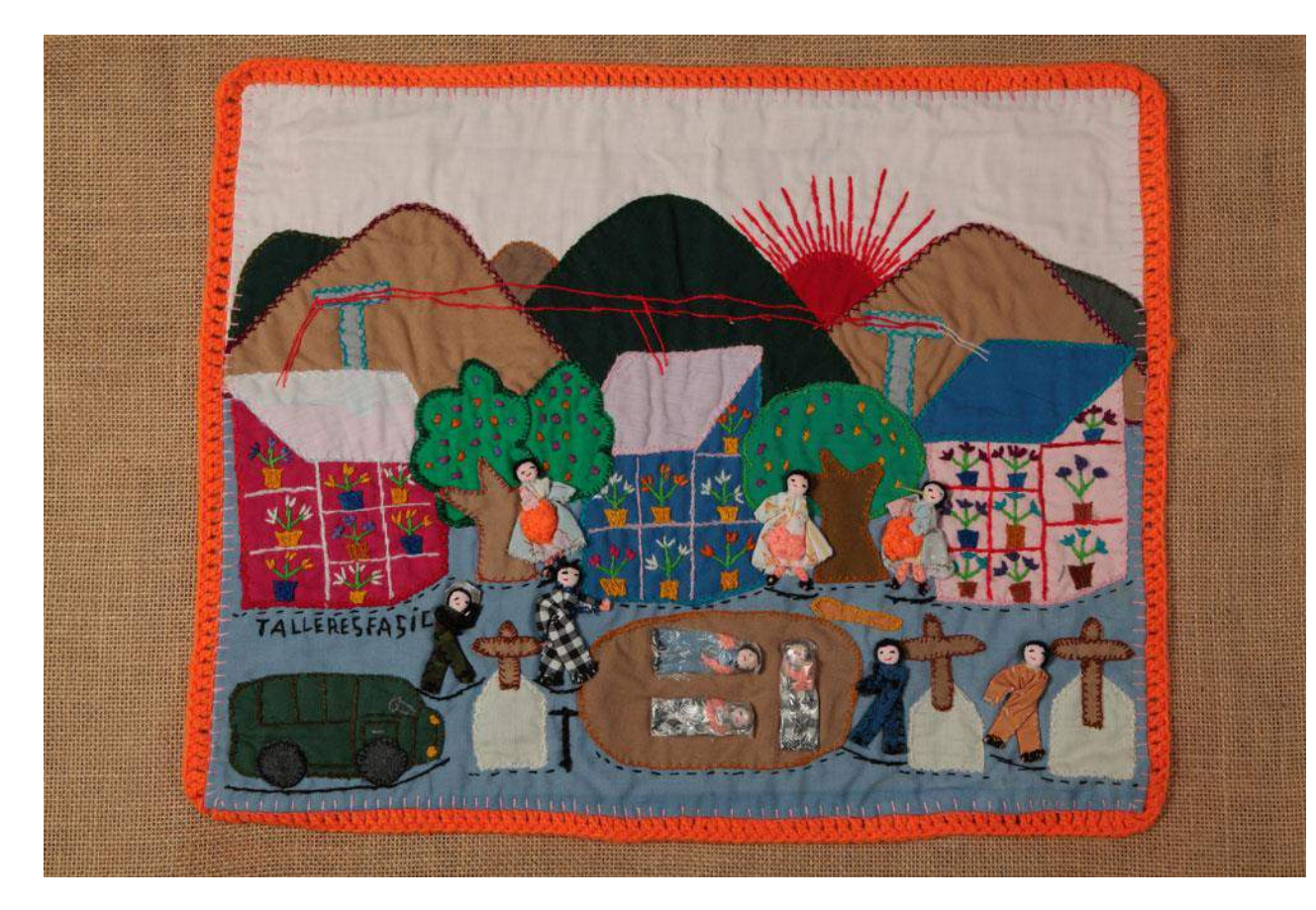
'Recuperación de cuerpos en 1990 / Recovering the disappeared in 1990', Taller Fundación Solidaridad.