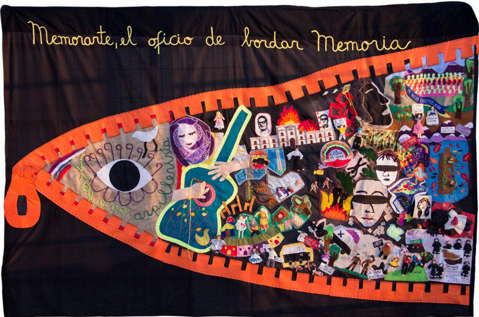
El cierre, Memorarte, 2016