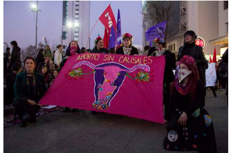
Top: Public manifestation for Infancy. Bottom: Public manifestation for safe and free abortion. Santiago, Chile. Memorarte, 2017