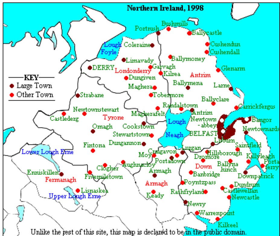
Map reproduced directly from: http://cain.ulst.ac.uk/images/maps/ni_towns.gif on 8 Feb 06